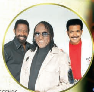
R & B LEGENDS COMMODORES