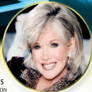
CONNIE STEVENS FILM AND TELEVISION ICON