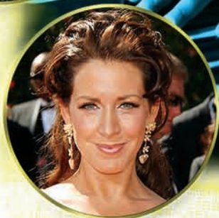
JOELY FISHER MUSICAL THEATER, FILM AND TELEVISION STAR