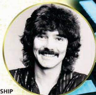
STARSHIP FEATURING ROCK ICON MICKEY THOMAS