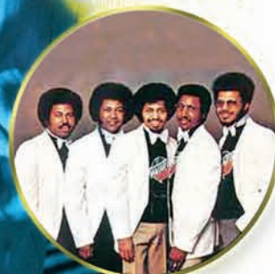
SOUL MUSIC LEGENDS TAVARES