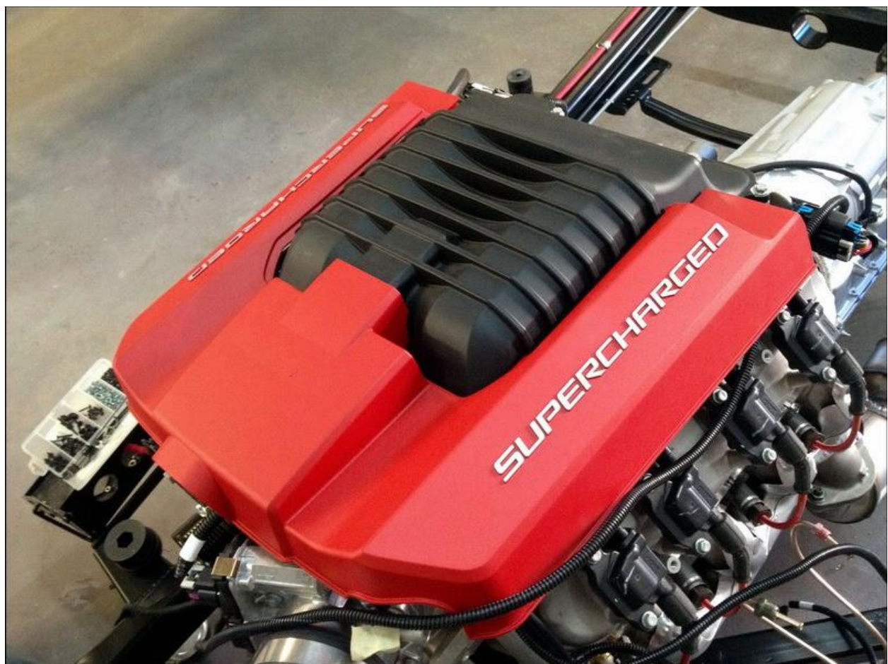
DiMora Motorcar's 556-horsepower supercharged V8 engine

At the Los Angeles Auto Show, the 430-hp DiMora Vicci 6.2 made waves with its daring design and impeccable craftsmanship. Known for its exclusive high-end automobiles and cutting-edge designs, DiMora Motorcar is now raising the bar and catering to another unique market that appreciates vintage automotive design with today's innovative technology.