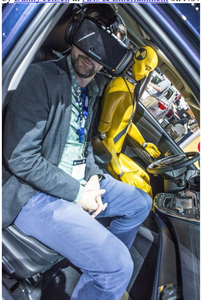
Test drive Toyota's new safety features with Virtual Reality goggles

by <u>Danny Jensen</u> in <u>Arts & Entertainment</u> on Nov 20, 2015 2:12 pm