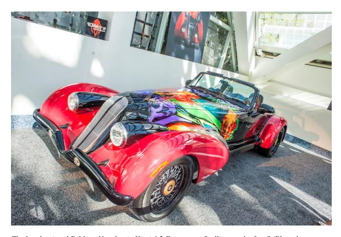
The hand-painted DiMora Neoclassic Vicci 6.2 Emperor, a "rolling work of art"

We also checked out the gorgeously hand-painted Neoclassic Vicci 6.2 Emperor convertibles in the lobby, built by Palm Springs-based DiMora Motorcar and painted by renowned artist Master Lee Sun-Don. The vibrant paint job, 24-karat gold trim and the handbuilt 1930's Art Decoinspired hot rods run for a cool $1.2 million eachô so a bit out of our price range, but pretty to see.