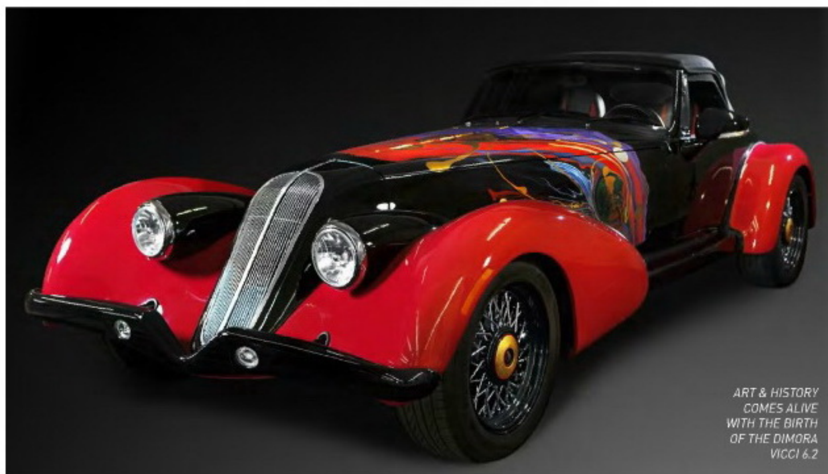
ART & HISTORY COMES ALIVE WITH THE BIRTH OF THE DIMORA VICCI 6.2

"Having both art and automobiles is the best of both